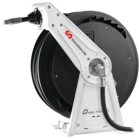
Roller arm in tank/wall mount position