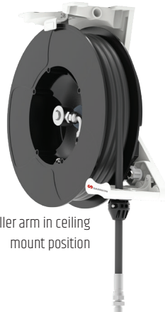
Roller arm in ceiling mount position

For reels delivered with arm in side mount position, add the suffix SM to the hose reel part number. i.e. 506 101SM